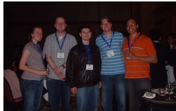
Students enjoying the 2007 Bash at the Annual Meeting