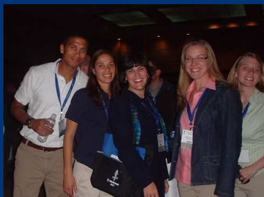
Opening reception at Annual Meeting

For more information please visit www.biomaterials.org